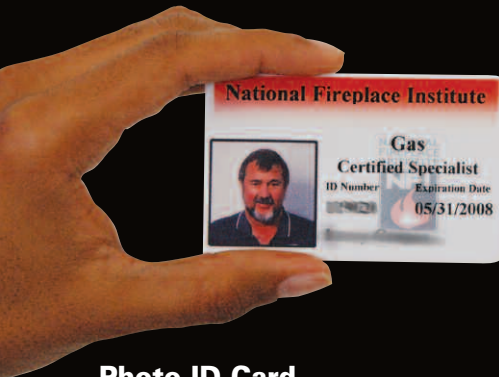
Photo ID Card

Note: Only currently certified NFI Specialists are authorized to wear an NFI patch.