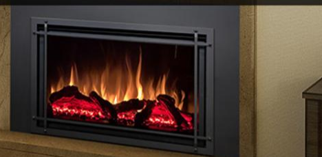
OSSEO 29 and OSSEO 34 Electric Inserts for ZC Fireplaces