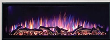
OSSEO 45 and OSSEO 60 Electric Linear Fireplaces