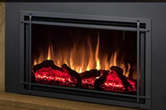
OSSEO 29 and OSSEO 34 Electric Inserts for ZC Fireplaces