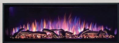
OSSEO 45 and OSSEO 60 Electric Linear Fireplaces